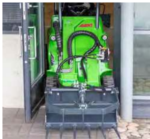
Width with 5.70-12 tyres 930 mm