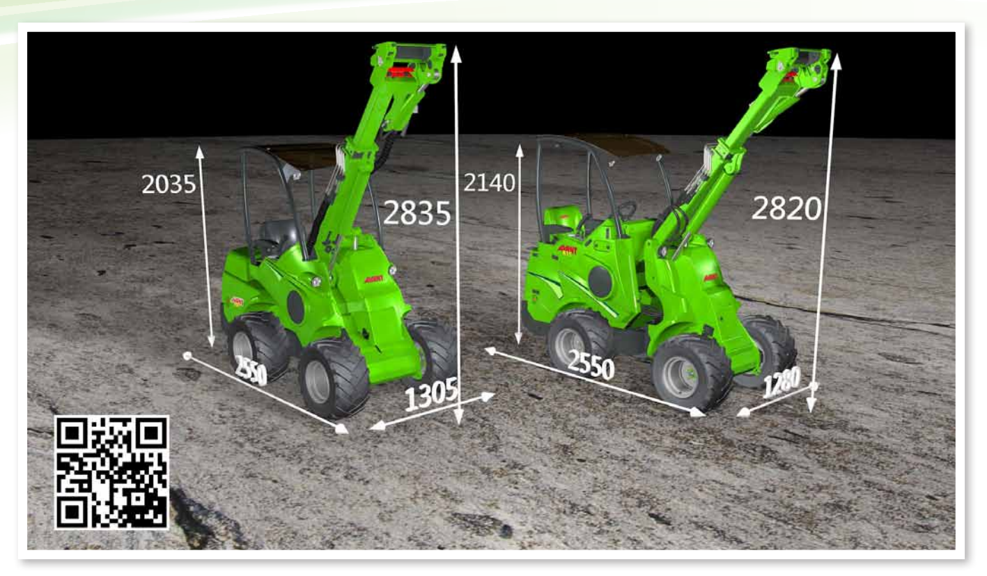
See the comparison video of Avant series via QR-code or from Avants youtube-channel www.youtube.com/user/avanttecno

language very well. Even though R Series loaders have slightly worse visibility to the frontline and attachment, it is still much better than in many similar purpose loaders in the markets. In addition, the R Series loaders are about 10cm higher that other Avant's and it has a little bit weaker tipping force", says Käkelä.